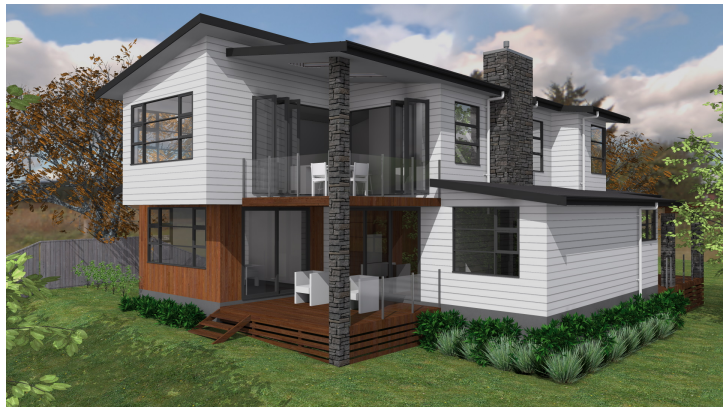
Artists Impression - Landscaping & Colours Indicative Only