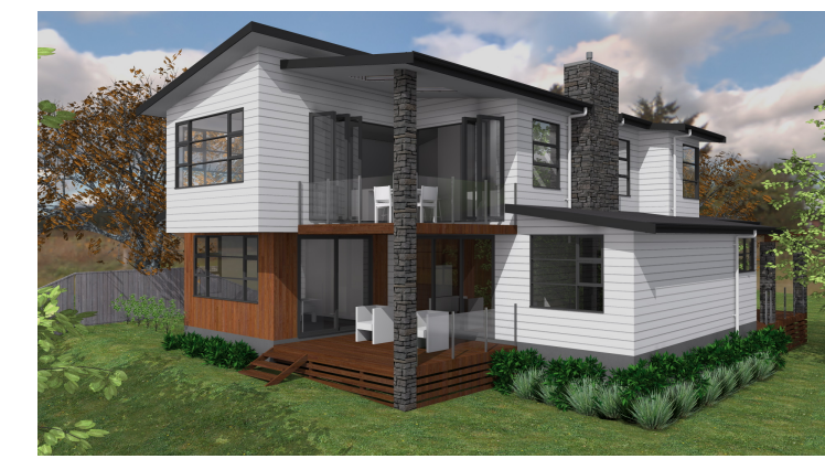
Artists Impression - Landscaping & Colours Indicative Only